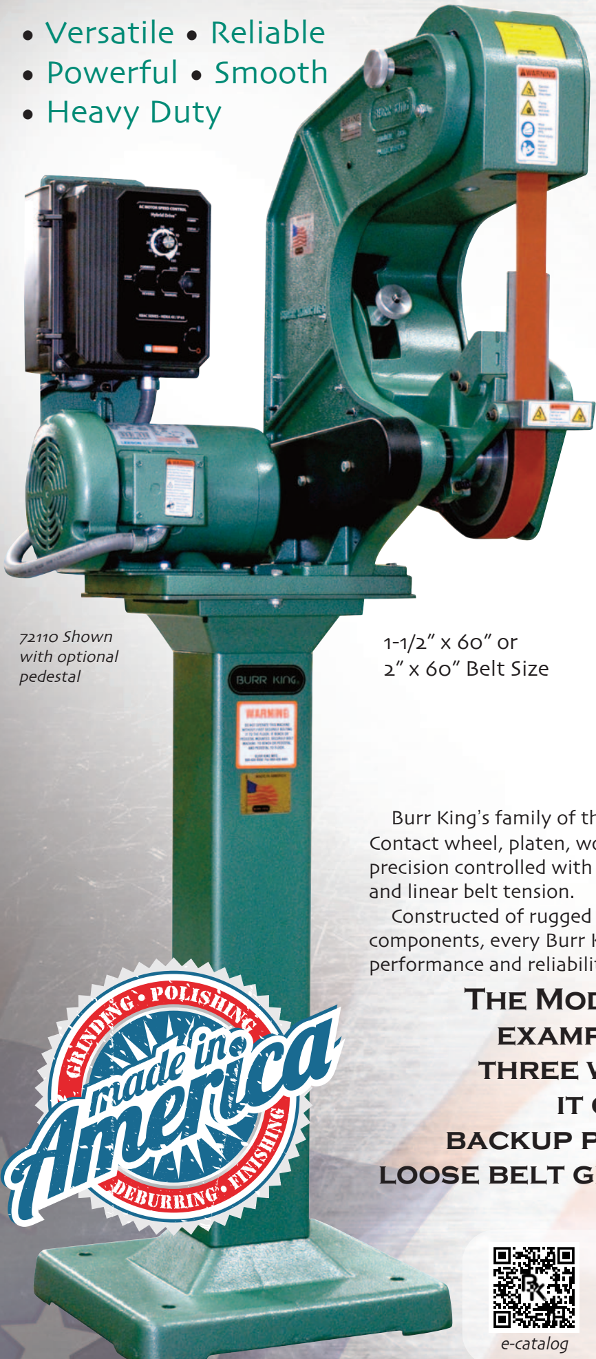
72110 Shown with optional pedestal