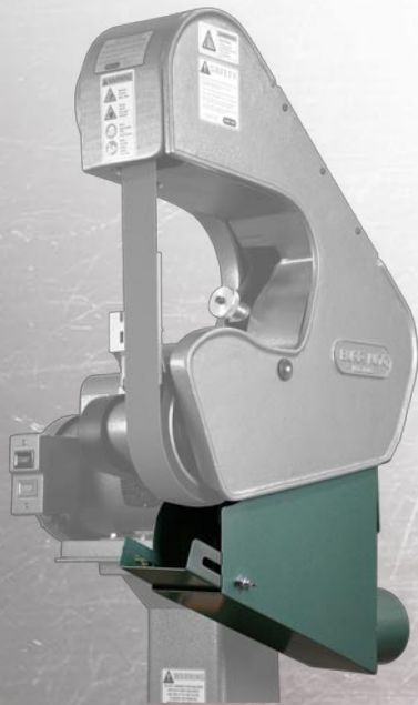
Model 760 (70100) shown with optional DS7 dust scoop