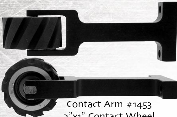
Contact Arm #1453 2"x1" Contact Wheel