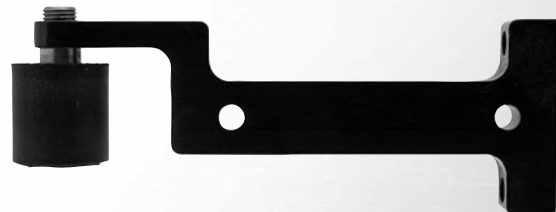
Contact Arm #1452 3"x1" Contact Wheel