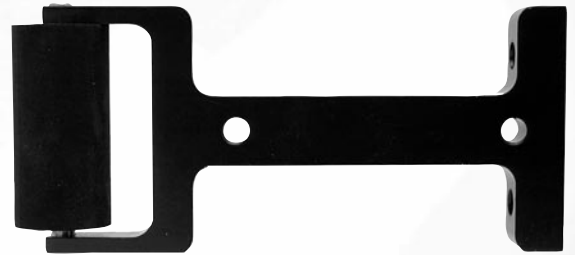
Contact Arm #1443 1"x2" Contact Wheel