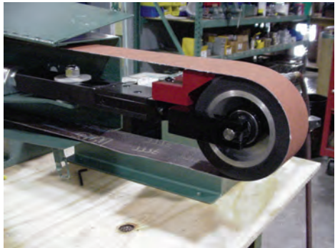
Picture 2: Note red pinch guard. Note guard door is open, do not operate the machine with the guard door open.