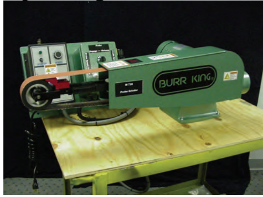
Picture 1: Shown, a model 720 with optional 4 inch diameter wheel, variable speed, with remote control console. Note guard door is closed and latched.

The model 720 belt grinder is a two wheel path belt grinder that uses a 2 x 72-inch continuous loop abrasive belt. For maximum effectiveness, and operator safety use abrasive belts manufactured by well respected abrasive manufacturers.