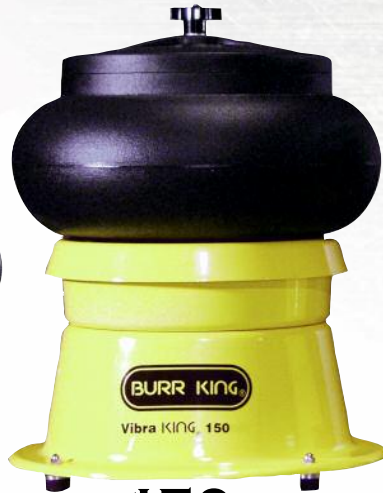
150 15000-1 shown