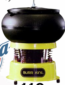
110 11000 shown