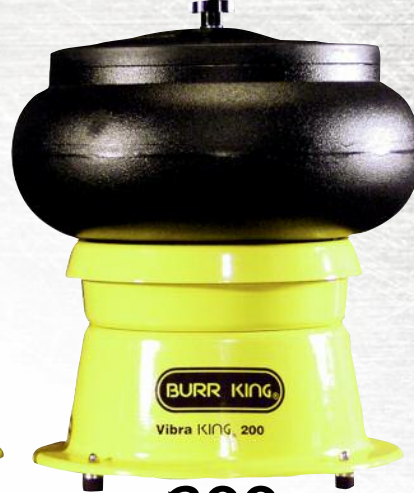
200 20000-1 shown

Burr King vibratory bowls are ideal for bench top polishing, descaling, deburring, and surface conditioning. Units are fast, quiet, and effective. Available in 3 qt, 10 qt, 20 qt, and 40 qt volumes.