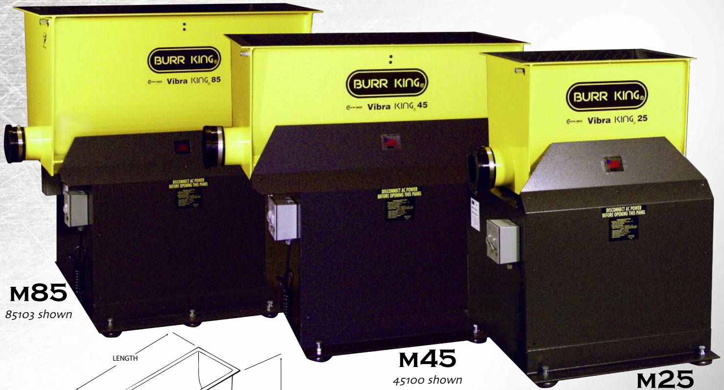
M85 85103 shown