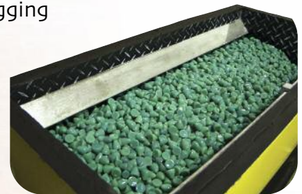
Optional deflector, prevents flat parts from sticking to machine wall.

Optional magnetic starter with integrated timer. Available in single or three phase voltages.