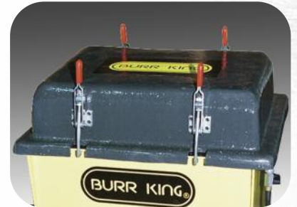
All Vibra King Chambers accept optional Vibra Hush lids reducing sound emission 3 to 6 db.