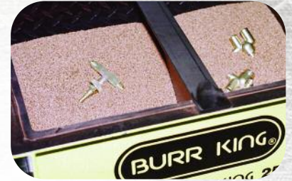
All Vibra King Chambers accept one to four dividers.

Let Burr King Test Process Your Parts. -No Obligation -Full Report -FREE