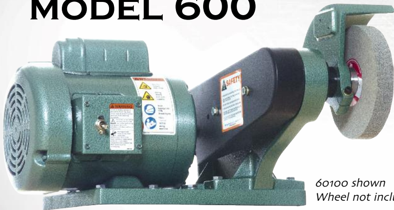
60100 shown Wheel not included

The Model 600 and 800 machines provide fast and effective graining, finishing, deburring and surface conditioning. Designed to run nylon, flap, wire, and buffing wheels. Variable speed options extend the range and capability of the Model 600 and 800 machines. Composite, vitreous, and stone wheels are prohibited on the Model 600, and Model 800 and Burr King grinders.