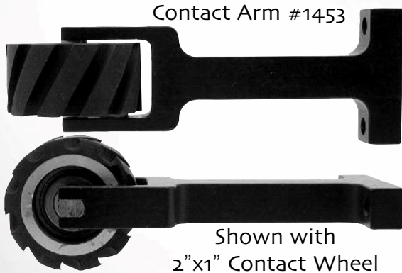
Contact Arm #1453