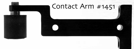
Contact Arm #1451