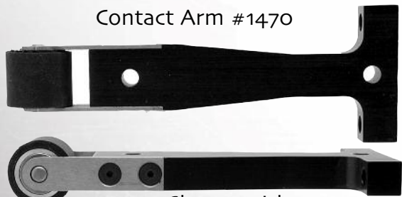
Contact Arm #1470