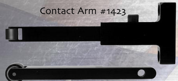
Contact Arm #1423