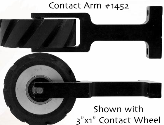
Contact Arm #1452