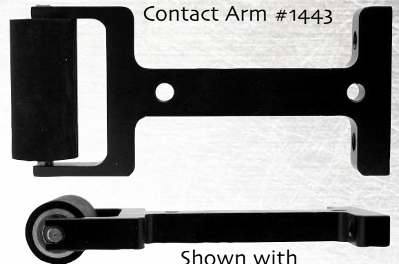
Contact Arm #1443

Call Us For Additional Specifications and Options