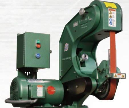
Optional magnetic starters provide safe and efficient 3 phase power