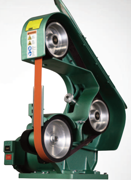
All aluminum construction allows the 760 to run fast and smooth.

The 1400 series small wheel attachments allow you to grind in places you wouldn't have dreamed of before. Wheels from 9/16" to 1.5" in diameter are available.