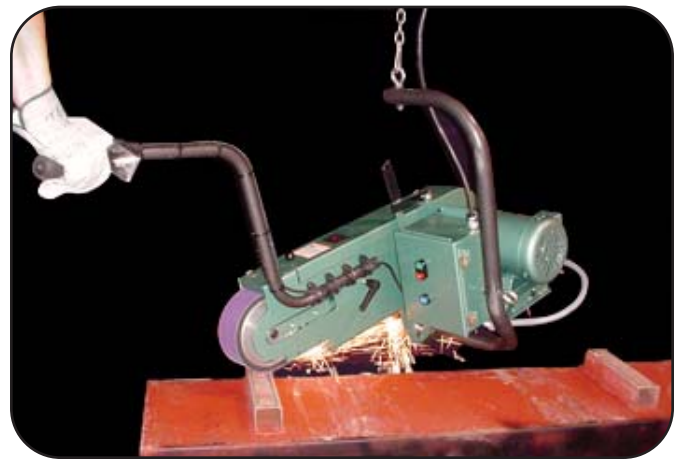
Model 979 adapts as a swing grinder.