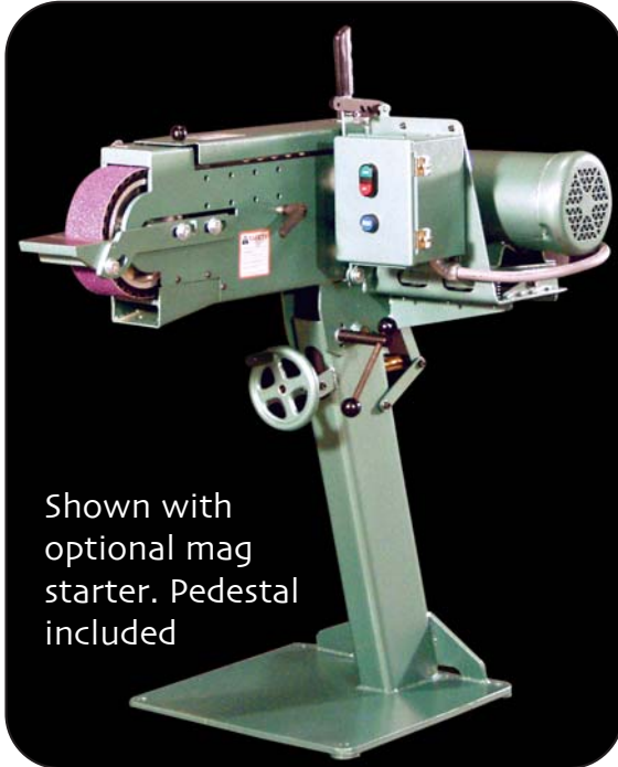
Shown with optional mag starter. Pedestal included

This aggressive belt grinder features a 3 x 79 inch belt track with heavy steel construction to deliver material finishing with the quiet, smoothness that customers expect from a quality grinding machine year after year.