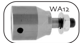
For wheels with 1/2" bore