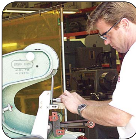
Custom Car Fabrication