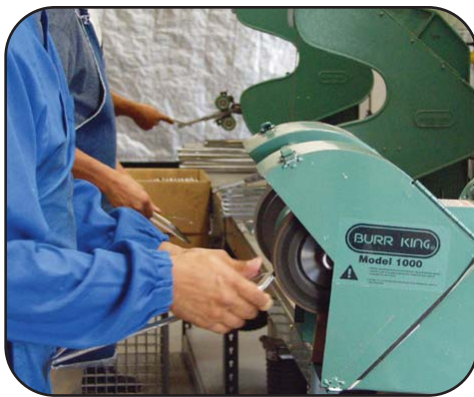
License Plate Frames