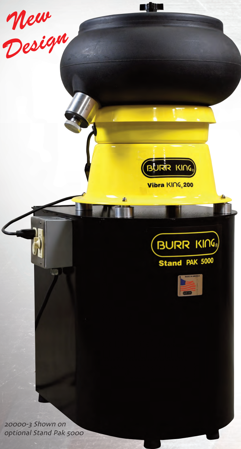
20000-3 Shown on optional Stand Pak 5000